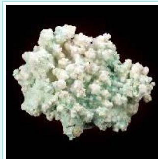
Aragonite Daylight Mine, Daylight-Narragansett Mines, Rosemont, Helvetia-Rosemont District, Santa Rita Mts, Pima Co., Arizona, USA

Workings include tunnels and shafts. Averaged 7.01% Cu. Yielded 13,248 tons (1,611,429 lbs.) Cu (1917). 1870-1961 Average 4% Cu, 0.5 Oz/ton Ag 90000 tons.