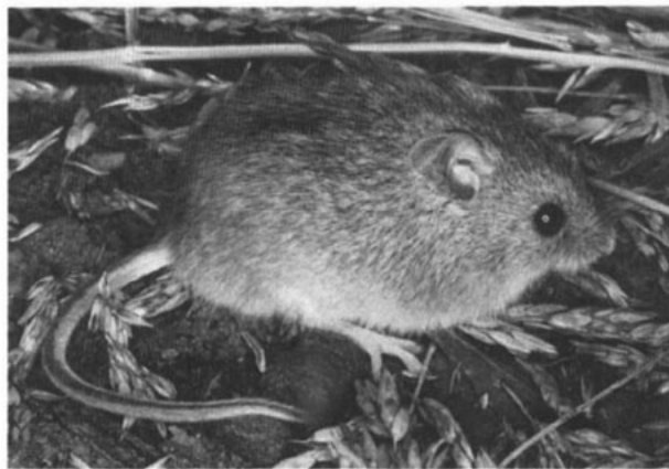
FIG. 1. Photograph of Reithrodontomys montanus from Fairfield, Freestone County, Texas.

DISTRIBUTION. The geographic distribution of the plains harvest mouse (Fig. 3) extends from southwestern South Dakota